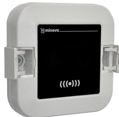
Blind lids for wall mounting